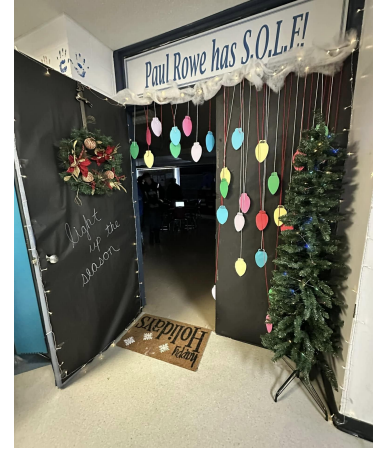
There was some stiff competition in this year's Christmas door decorating contest!

The staff would like to thank everyone who donated all of the Christmas goodies!