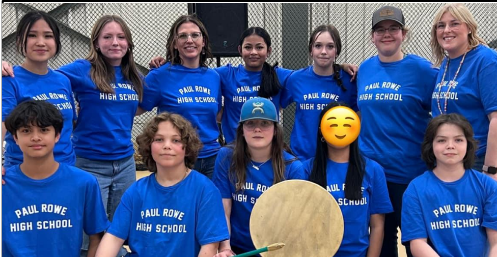
Our Hand Games team has been invited to represent PRSD at the High Prairie Pow Wow! See pg. 5 for more details!