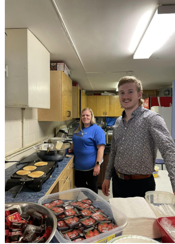
May Food for Thought Breakfast Program Volunteers STAT Energy, Vision Credit Union and Terra Goodzeck!