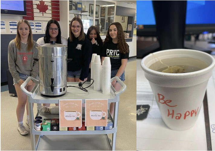
Our Students Against Destructive Decisions (SADD) students delivered cups of Positivi-Tea!