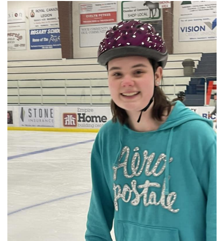
Grade 7-10 students enjoyed a trip to the Jack McAvoy Arena for some indoor and outdoor ice time!