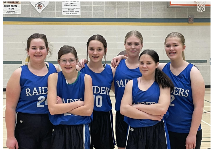
Our junior girls basketball team have been playing their hearts out! The 6 girls pictured above played against a team with 2 full lines, took them to OT and came up short by only 1 point! Luckily more of their teammates have been able to play in their other games! Way to go Raiders! 🎉