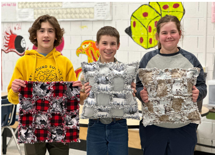
Grade 7 students have been sewing rag pillows in Home Ec. while grade 8 students have been working on various woodworking projects!