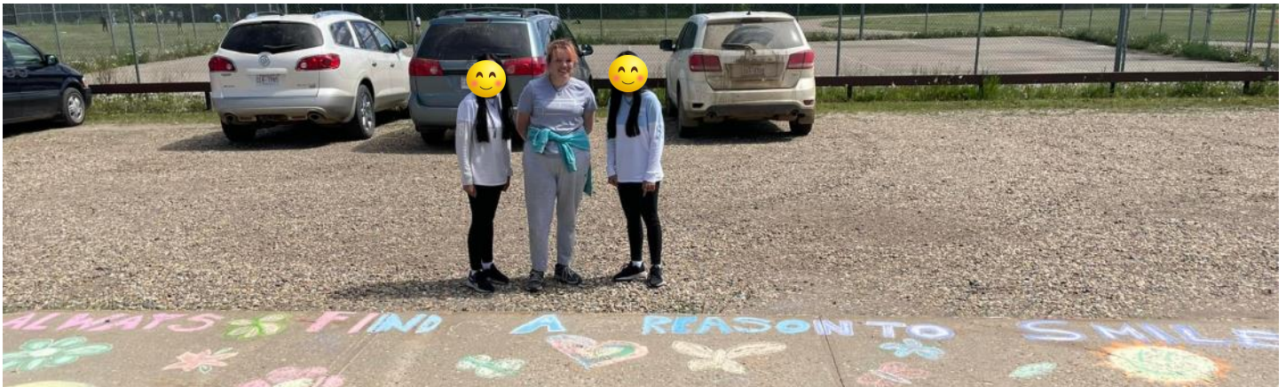
Over the past month, students have had a great time creating sidewalk chalk masterpieces! Thanks to FCSS for the chalk!!