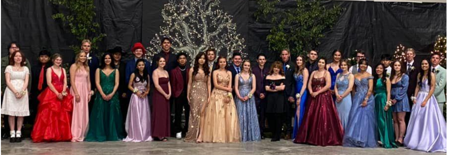
Class of 2022 graduates were joined by their escorts prior to the first dance.