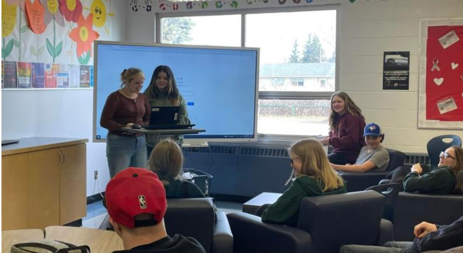
Celebrating education by hosting a Poetry Café was just one of many events held at Paul Rowe in the week of May 2-6!

Each May, our school shows support for the Canadian Mental Health Association (CMHA) by participating in Mental Health Week activities. The 2022 CMHA Mental Health Week slogan was "This is empathy." "Empathy. It's the capacity we share as human beings to step into each other's shoes. To understand where they're coming from and what they're feeling. To listen hard and refuse to judge. It's also one way to reduce and resolve conflict."