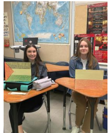
Social 20 students were learning through experience with this model UN project! It was an excellent debate with great points made about current world issues from all representatives!