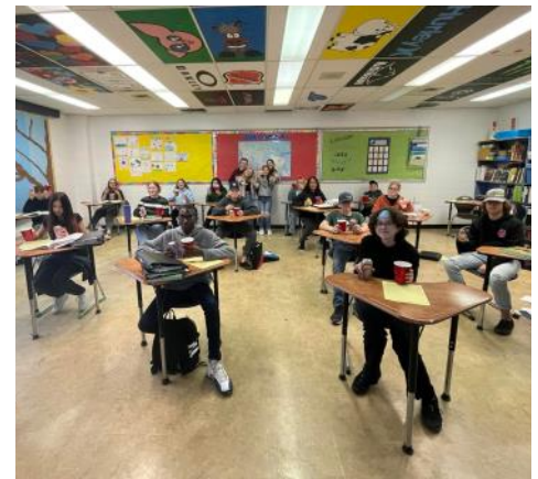
The grade 7 class enjoyed floats after winning SCOER's class colour day competition!

Please follow our school Facebook page at facebook.com/PaulRoweHigh and/or check our website at www.paulrowehigh.ca for event updates!