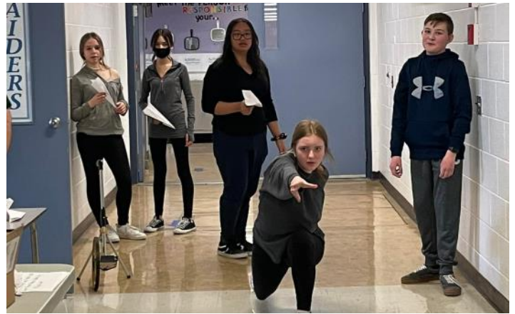
Grade 7 students tested some aerodynamics with paper airplanes during SOLE block!