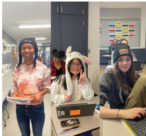
We participated in "Hats On! For Mental Health" To learn more visit www.canwetalk.ca .