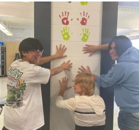
An annual tradition, new students added their handprints to our hallways!