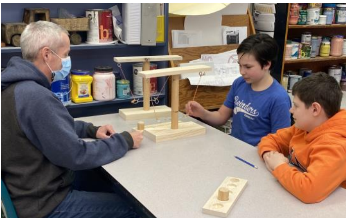
Shop 8 students built and tested tabletop Hook and Ring Toss Battle games.