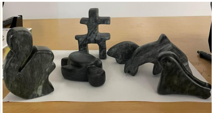
Art 9 students created some amazing soap stone carvings.