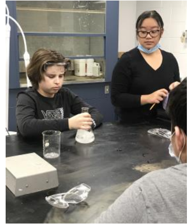
Science 7 finished the Heat and Temperature Unit by completing experiments on Sublimation, Evaporation and Condensation.