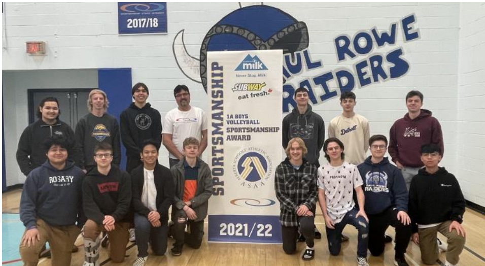
Our Senior Boys Volleyball team was nominated to receive the sportsmanship award from other teams at provincial tournament.

Raiders Awarded ASAA Provincial Volleyball Sportsmanship Banner