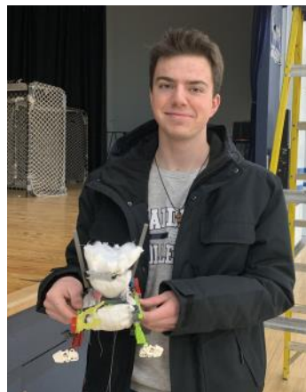
Physics 30 students used the engineering design process for their advanced egg drop lab.