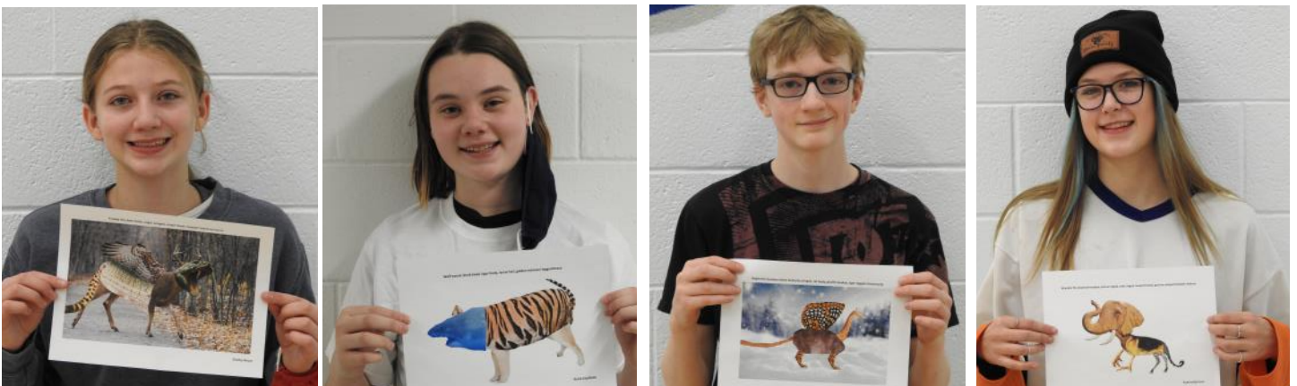
The final assignment for Computers 8 students was to use PhotoPea to create "composite beasts" by cutting and erasing objects.