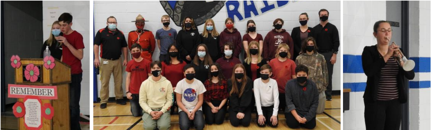
Below: Royal Canadian Legion Remembrance Day Poster and Literary Contest winners from our school received their prizes from the local level.