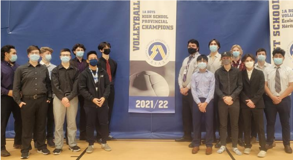
The senior boys' volleyball team capped off an exciting season with an appearance at the 2021 ASAA provincial championships.

After a 2020 season without any competition due to the pandemic, this past season saw the school field three teams: