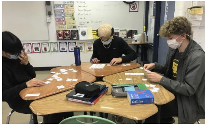
French 10 students are learning present tense regular verbs.