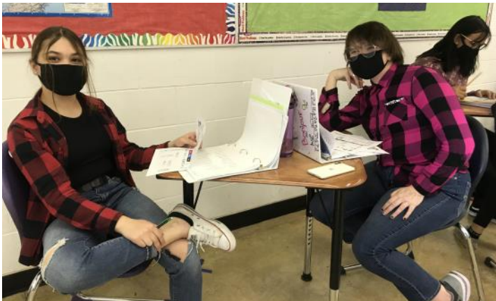
French 7 students practiced vocabulary for their L'ecole unit by playing La Bataille Navale (Battleship)