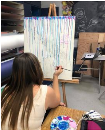
Senior high art students have been busy creating independent projects (Art 30) and exploring the lines in their world (Art 10).