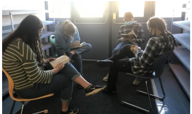
English 20-1 students read the classic tale of Frankenstein in their literacy groups.