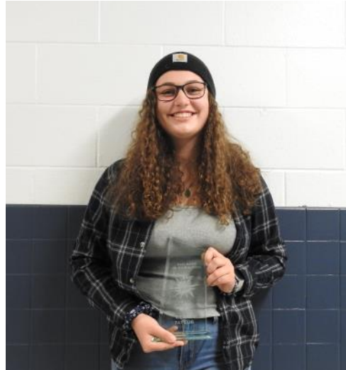
Student of the Year Awards are awarded using a formula blending Academics, Athletics and Extracurricular Activities.

Paul Rowe Jr./Sr. High School recently celebrated the academic, athletic and extracurricular achievements of our students at our Awards Day ceremony for the 2020-2021 school year. Due to COVID-19 restrictions, our school held a virtual assembly via Google Meet with student cohorts joining in from their classrooms. Unfortunately, our school was unable to open the ceremony to families and the public, however a video slideshow of our award recipients was posted to our school Facebook page and website following the ceremony.