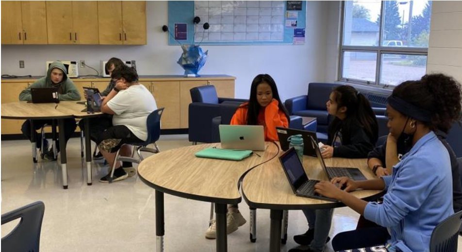
The staff at Paul Rowe welcome students, parents & the community to the 2021-2022 school year.

The new school year is underway, and students and staff are settling into our new routines. We are happy to announce that the 2021-2022 Alberta Education School Year Plan and the corresponding Peace River School Division Back-to-school Re-Entry Plan has allowed us to resume some programs and activities previously suspended due to COVID-19 restrictions.