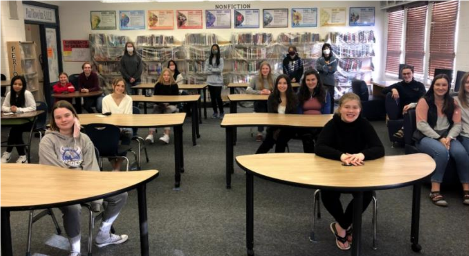
This enthusiastic group of students has been finding ways to engage with and unite our entire school community!*

Since September, our student council members have been successfully organizing "Covid-friendly" school spirit events and activities. The aim of these events is to improve student wellness and to ensure that all students have the opportunity to feel connected to the larger school community while we must remain apart in classroom cohorts.